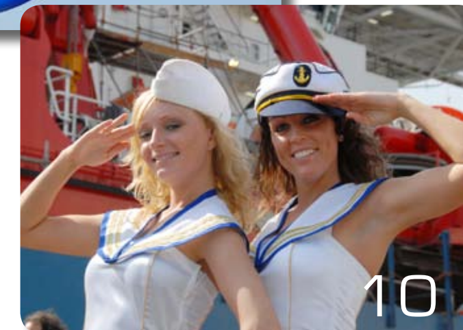
Front Cover: Pipelay and Construction Vessel Seven Seas, a coproduction of IHC Merwede Shipyard and Huisman-Itrec.